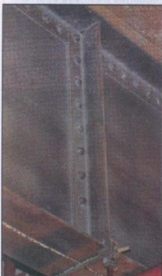
Steel I-beams held by rivets.