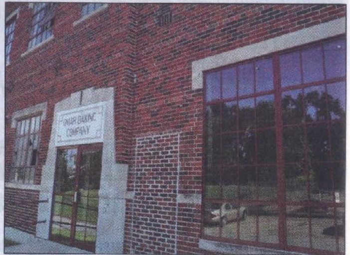
The building has about 50 metal and paneled windows.

A fire in late 2008 set back the work, which is now back on schedule, Trimble