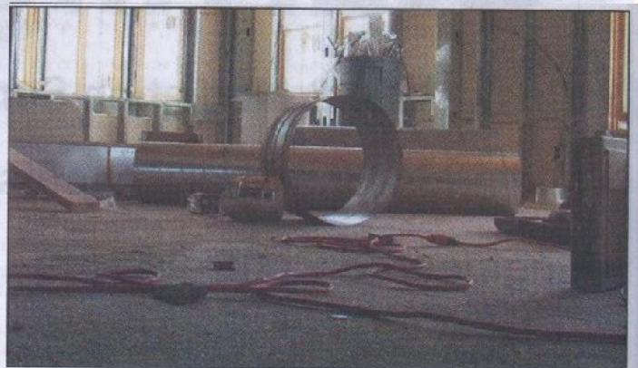
A fire in late 2008 affected progress.

said. Four groups have already shown interest so work could begin on partitioning for individual tenants at any time. Since everything rides on individual decisions by different organizations, there can be no set day for total completion, Donovan said.