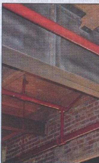
The 1923 building features warehouse-style materials.